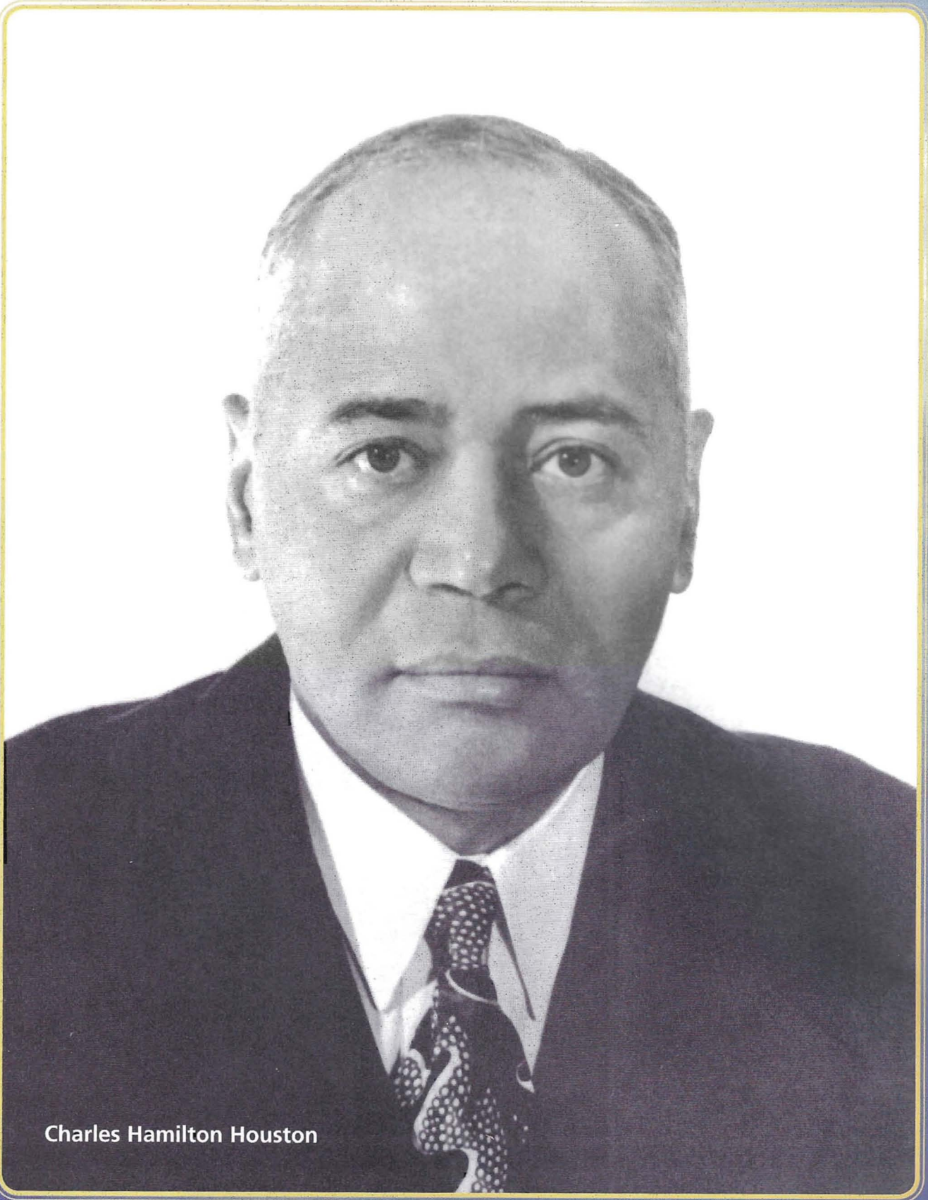
Charles Hamilton Houston